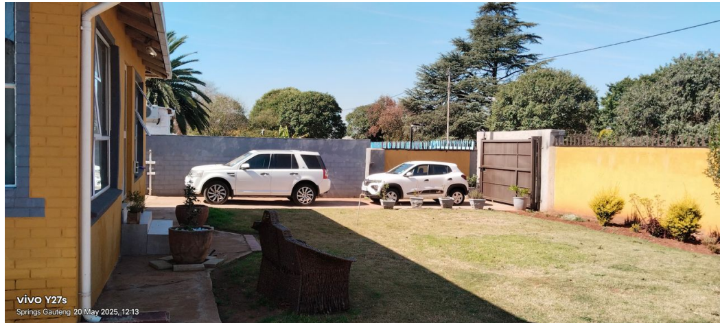
vivo Y27s Springs Gauteng 20 May 2025, 12:13

64 Michelle Avenue Randhart Alberton 1449